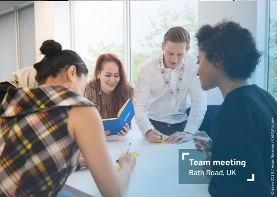
Team meeting Bath Road, UK